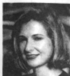
Producer: Lynda Redfern