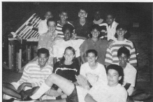
Some Enchanted Evening