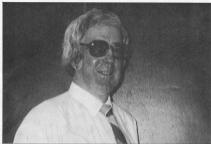
A Chip in the Sugar